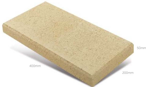
Havenslab® 50 12.50 units per m 2